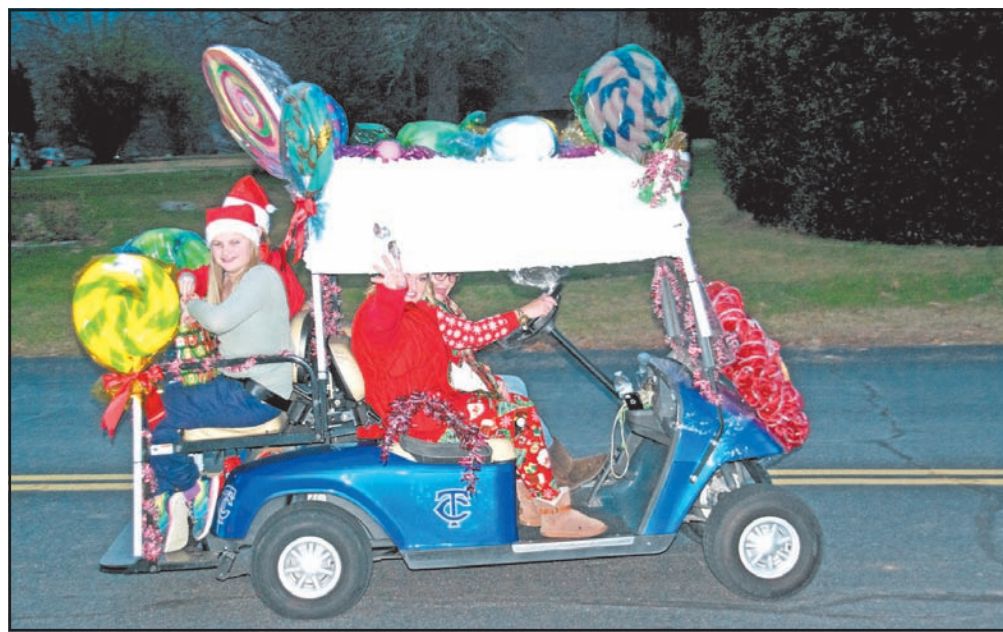
The Towns County Elementary School entry into the golf cart parade that Saturday.

Before the golf cart parade began, all those who